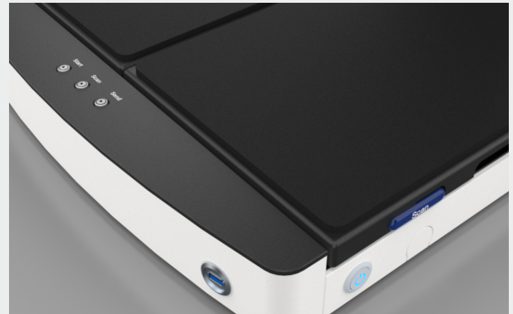
Store images directly to any USB devices via the USB 3.0 port

Full Coverage Warranty, up to 5 years of free spare parts and consumables.