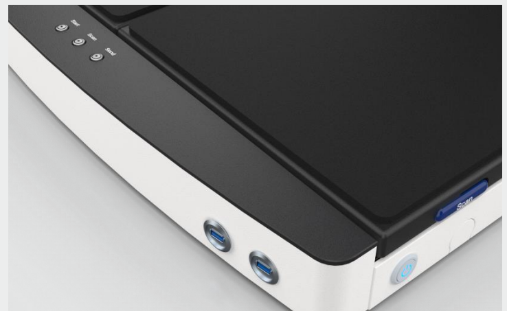
Store images directly to any USB devices via the USB 3.0 ports